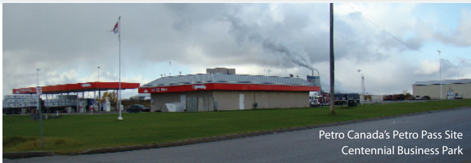
Petro Canada's Petro Pass Site Centennial Business Park

Available right now, commercial lots in Dryden's Centennial Business Park are ready to help you profitably serve your local and long-distance markets.